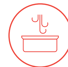
Cleaned with ionized air