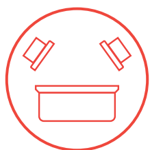
100% camera inspection